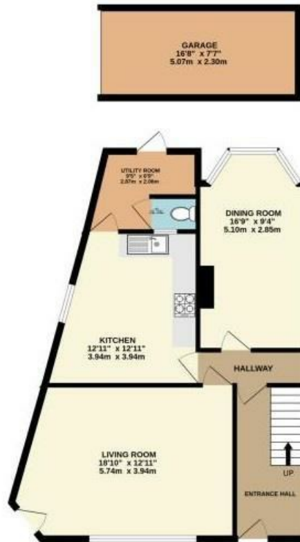
GROUND FLOOR 804 sq.ft. (74.7 sq.m.) approx.